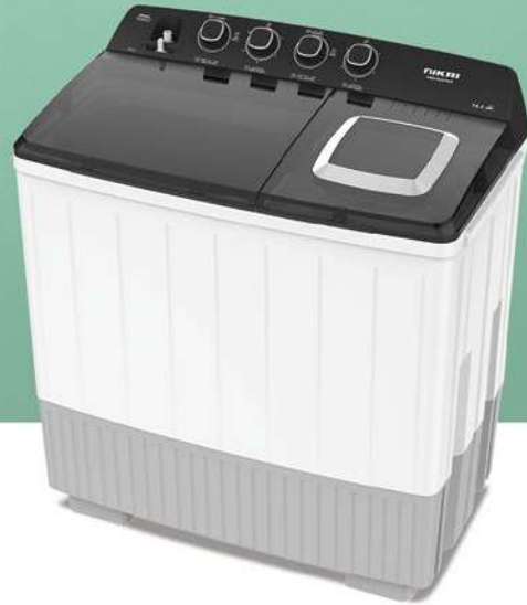
NWM1500SPN2B / NWM1300SPN2B