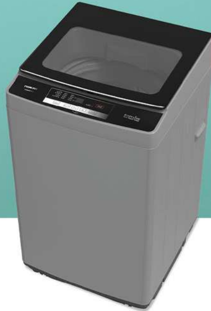
NWM1200TN24 / NWM1000TN24 / NWM800TN24