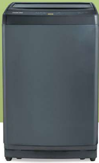
NWM1000TQB / NWM800TQB