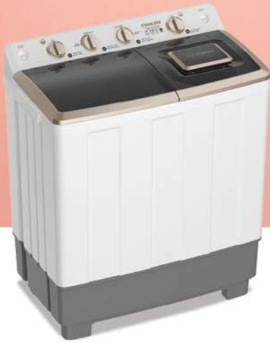
NWM1500SPN10 / NWM1204SPN10