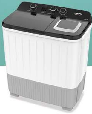
NWM900SPN2B / NWM800SPN2B